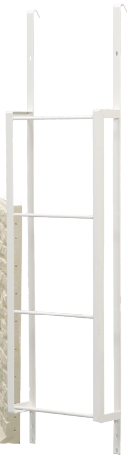
4 Rung Egress Ladder