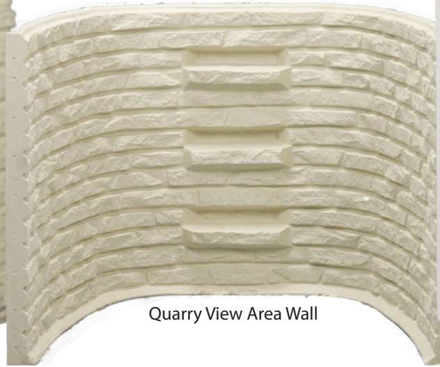
Quarry View Area Wall