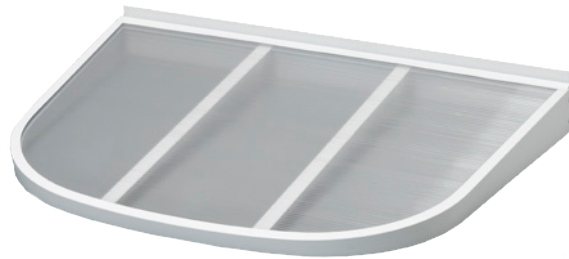
Thermal Hinge Cover