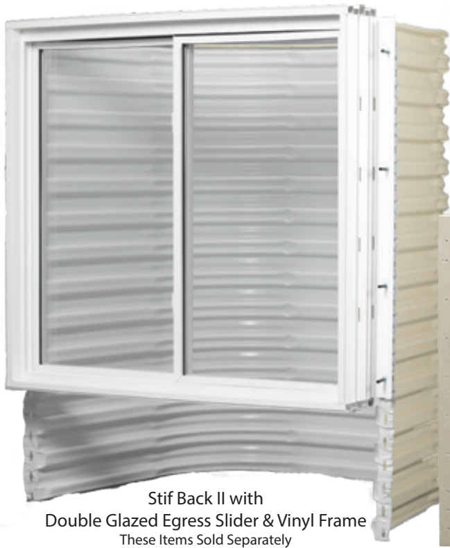
Stif Back II with Double Glazed Egress Slider & Vinyl Frame These Items Sold Separately