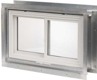
Window Buck Shown With Insulated White Vinyl Slider These Items Sold Separately