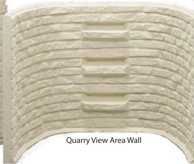
Quarry View Area Wall