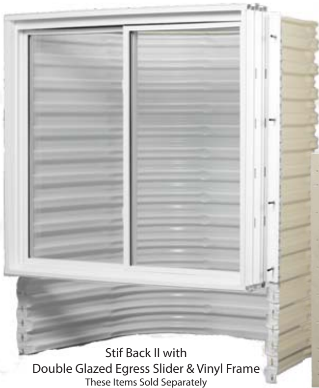
Stif Back II with Double Glazed Egress Slider & Vinyl Frame These Items Sold Separately