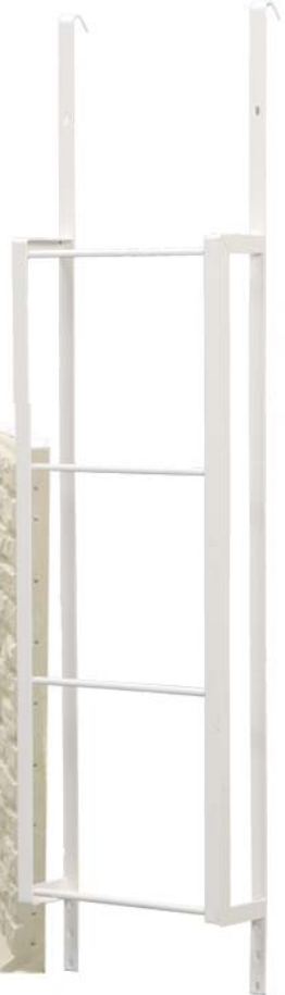
4 Rung Egress Ladder