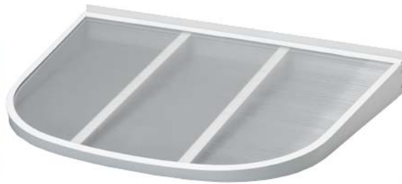
Thermal Hinge Cover