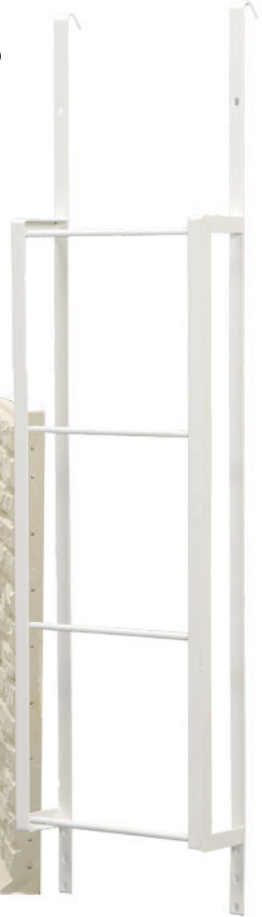
4 Rung Egress Ladder