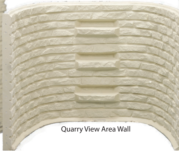
Quarry View Area Wall