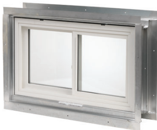
Window Buck Shown With Insulated White Vinyl Slider These Items Sold Separately