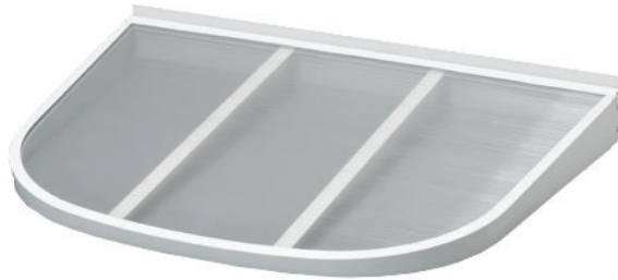
Thermal Hinge Cover