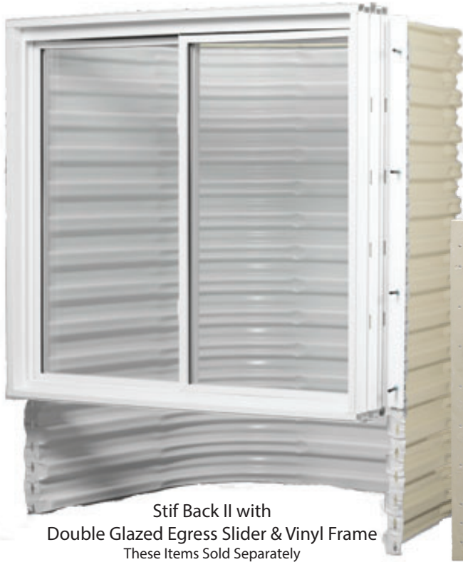
Stif Back II with Double Glazed Egress Slider & Vinyl Frame These Items Sold Separately