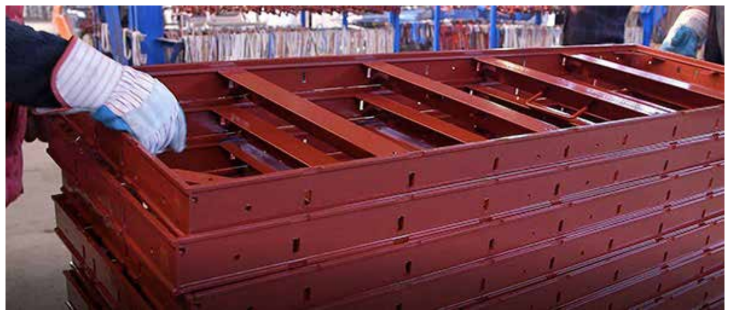
Form Renovation can be performed on most steel-frame, plywood-face, handset systems, including the Ellis Pro-Form, EMI Elite, Symons Steel-Ply and SureBuilt SurePly™ brands.